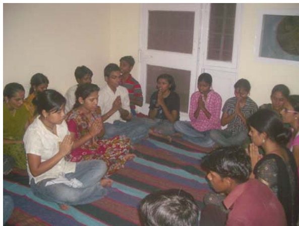
Summer Camp started on 22 nd May 2010

Pratibha Poshan Yojana (PPY) was started in the year 2007 when few talented children from distant villages at class-8 level were admitted for academic and financial assistance from Shiksha Sopan. Now these children have gone to class 12. We have guided them through postal packages, short visits and most intensively through 36-day Summer Camps. It is their third consecutive summer camp. The Camp started on 22 nd May 2010 with a brief inauguration. Classes and other activities started on 23 rd May. Faculty Quarter 515 is allocated for the Summer Camp.