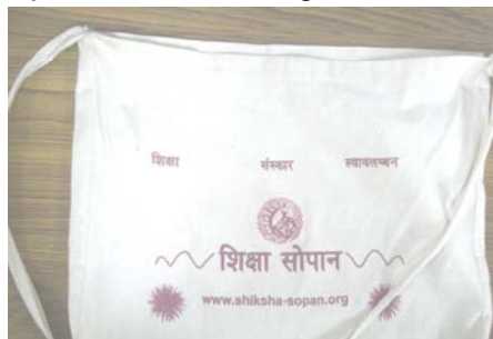
Shiksha Sopan Bags for Registration