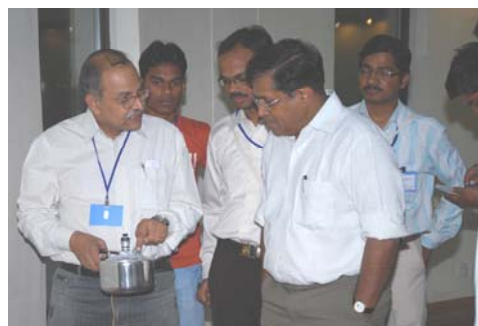
IIT K Director looking at the pressure cooker with thermocouple fixed inside

The participants were highly impressed by the hard work, scientific competence and management skills of Sopan workers. Many of them donated some money as a token of appreciation.